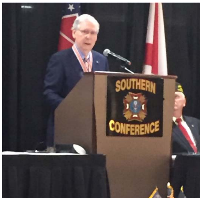
Senator Mitch McConnell speaks to the attendees about standing up for our values as Americans and preserving veterans' entitlements.