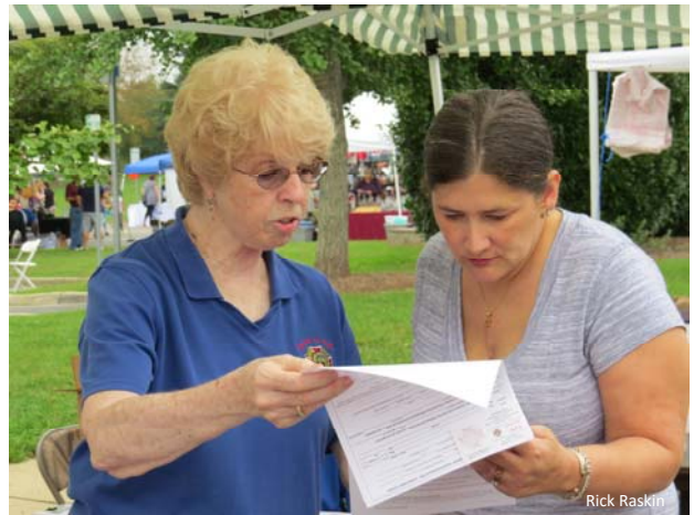
Interviewing a prospective Auxiliary member.