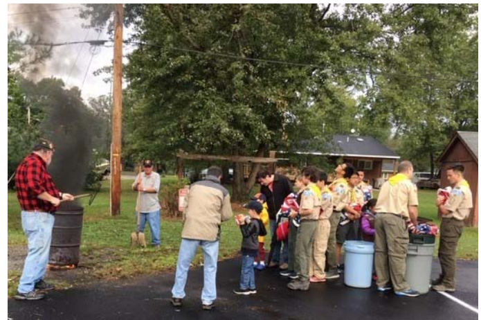
Preparing for the ceremony. Nylon flags which cannot be burned because of toxic fumes had their star fields removed before being disposed.