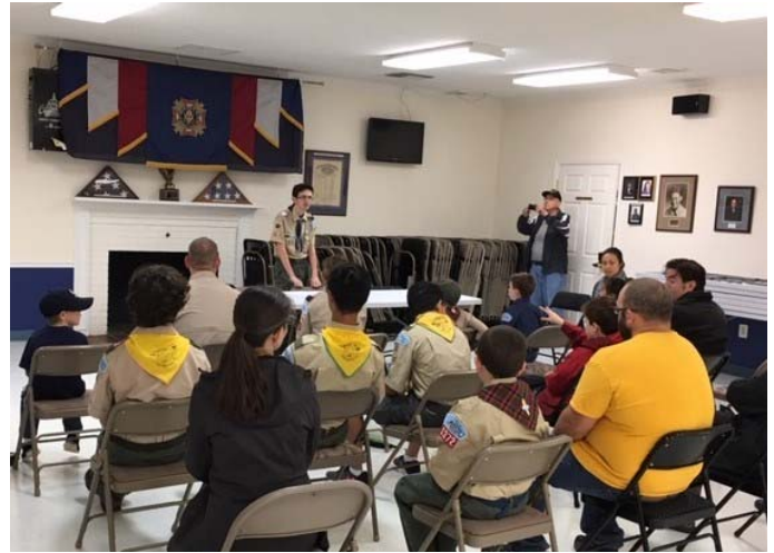
Flag education class was held prior to the retirement ceremony.