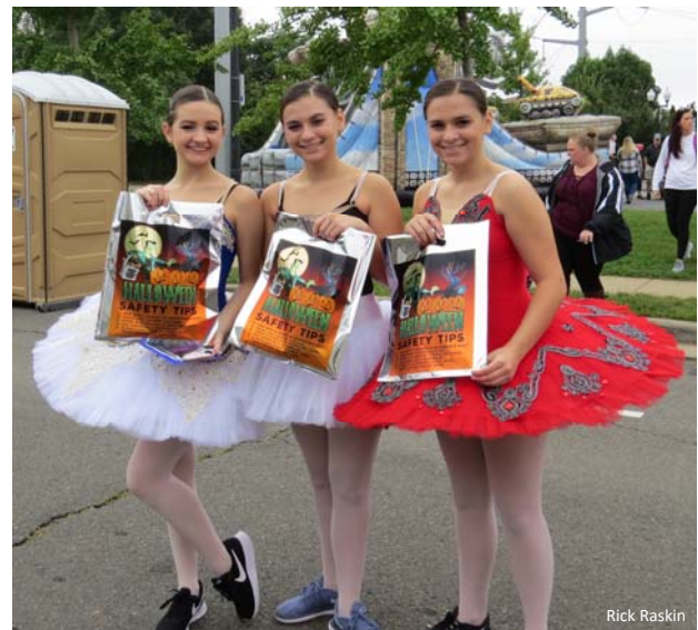
Trick or Treat bags — always popular with the crowd.