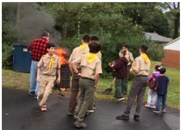
Cloth flags are retired by being burned. The ashes are then buried.