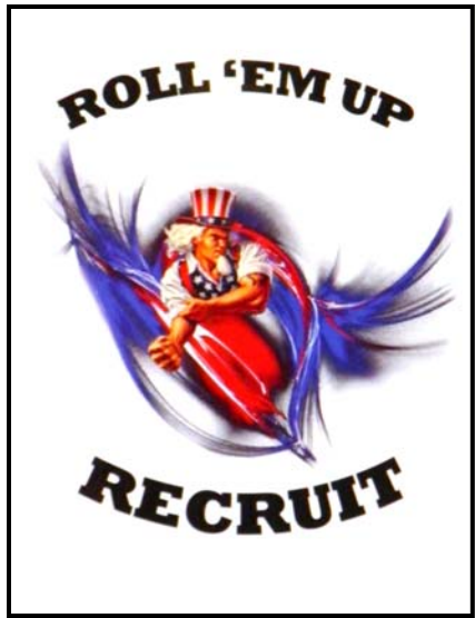
VFV's new recruiting poster unveiled at the Southern Conference.