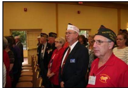
Part of the Virginia delegation