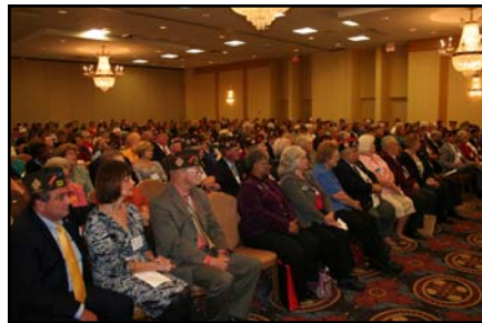
Over 400 delegates attended.