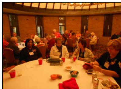
Virginia's hospitality suite