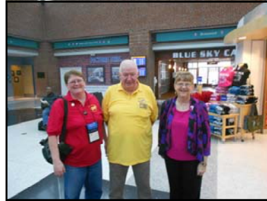
Airport greeters ready to go