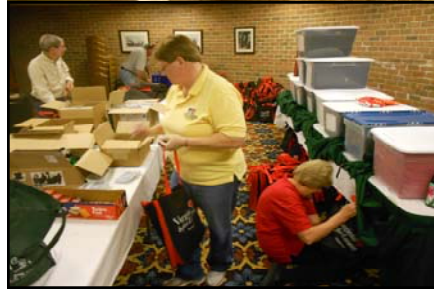
Setting up for registration