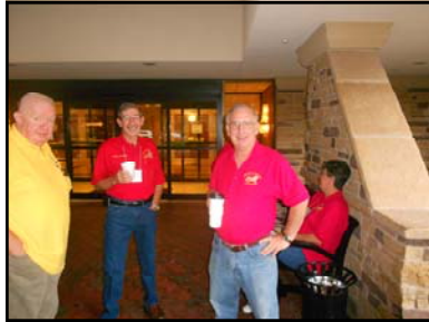
Preparing for the first airport run