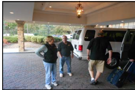
Getting ready for airport pickup