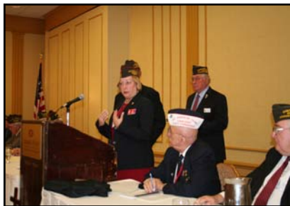
Margo welcomes the delegates