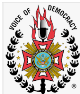
“My Pledge to Our Veterans”