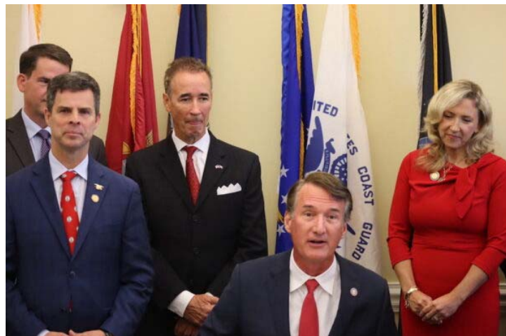
Virginia Gov. Glenn Youngkin (R) signs bills that alleviate taxes on military veteran pay at Quantico Corporate Center in Stafford County.

The region will soon be home to two new federal veterans' healthcare facilities. In Spotsylvania, The U.S. Department of Veterans Affairs is building a four-story, 450,000-square-foot clinic on a 48-acre at U.S. Route 1 at Hood Drive, opening next year.