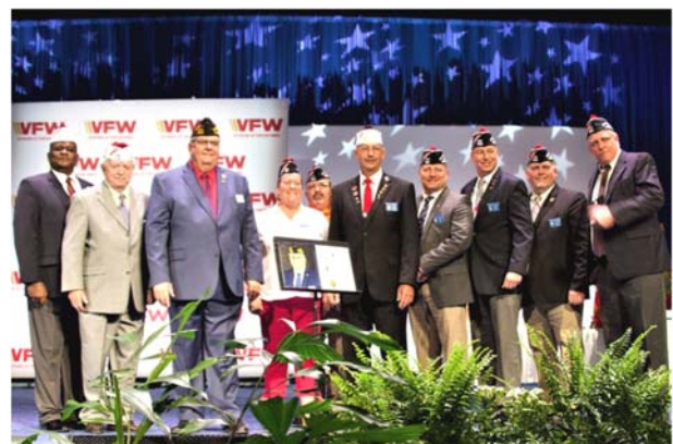
Virginia's 2020-21 All-American Commanders