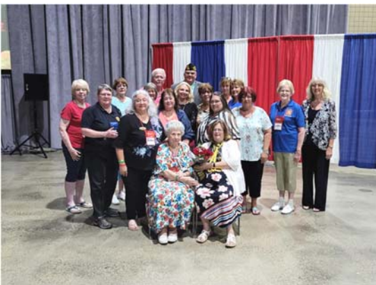
The Virginia Auxiliary's "Circle of Excellence"