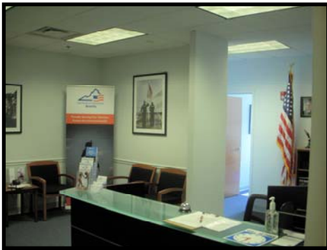
The new Manassas DVS office

It is impressive physically and even more impressive are the people who work there. Rather than give you a laundry list of services, I would just say that if you are a veteran with virtually any kind of question or problem, this office can help you immediately without a number of forms being filled out. If they can't help, they will quickly refer you to someone who can.