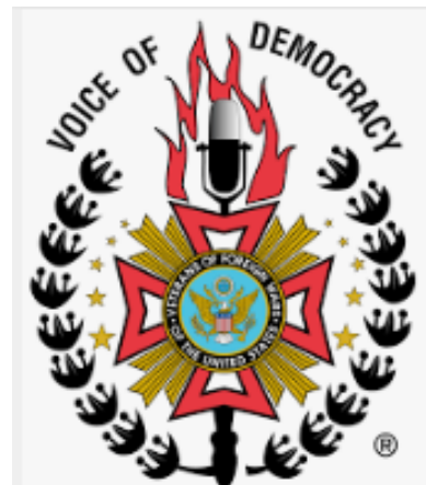
“Why Is The Veteran Important”