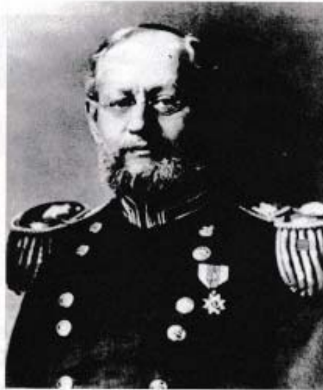
Henry Martyn Robert

At the end of Robert's military career, on April 30, 1901, President William McKinley