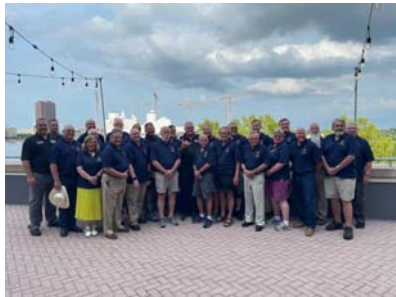
The 2020-21 "Covid Commanders"