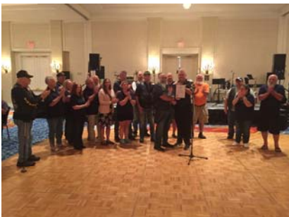
VFW Riders presented their check for $20,000 raised for the Vander Clute Ride to also support Unmet Needs