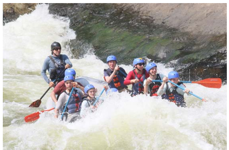
On a large raft hitting class 4 and 5 rapids in the New River Gorge.