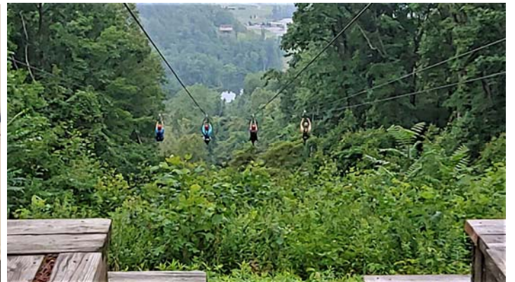
ALEX BLIEM / POST 7589

Alex Bliem commented on the Scouts' finale of their trip to the New River. "On the last day we arranged it so that everyone could ride the 'Big Zip' at Summit."