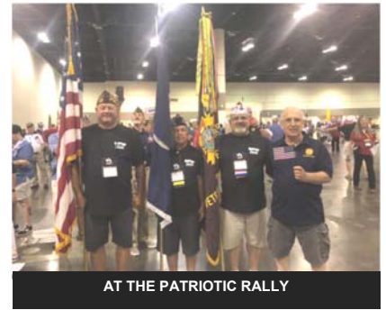
AT THE PATRIOTIC RALLY