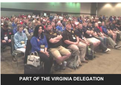
PART OF THE VIRGINIA DELEGATION