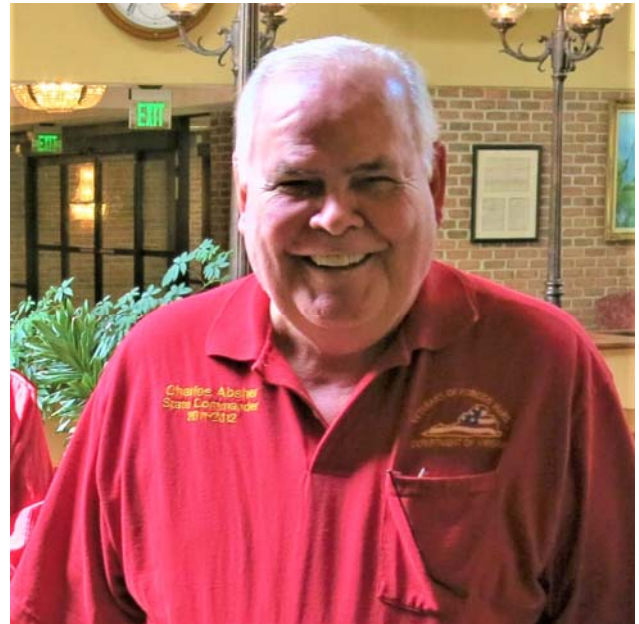
2015