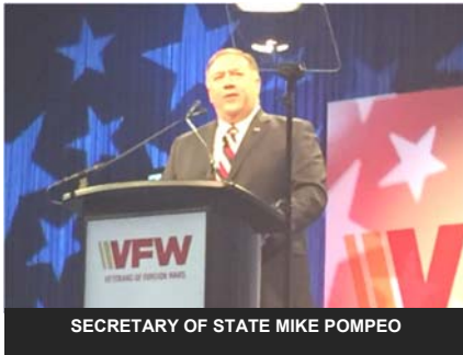
SECRETARY OF STATE MIKE POMPEO