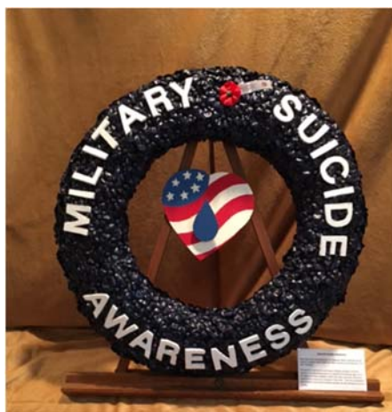
Auxiliary 7589's Buddy Poppy Display placed first in the State and was taken to the VFW National convention in New Orleans to compete at the National level.