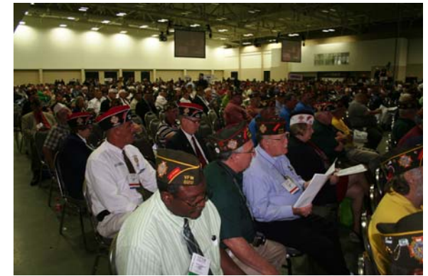
Part of the Virginia Delegation.