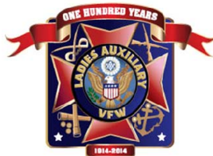
The new Auxiliary 100 year emblem