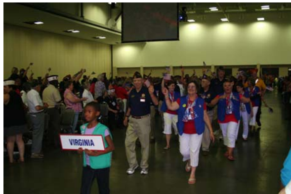
The Virginia delegation enthusiastically steps out.