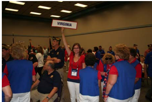
Virginia's participants in the Patriotic Rally at the National Convention gather prior to stepping off.