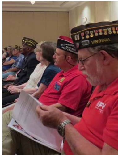
Posts 7589 & 9835 at the awards ceremony