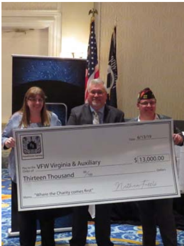
Powerhouse Gaming's $13K donation to the Auxiliary