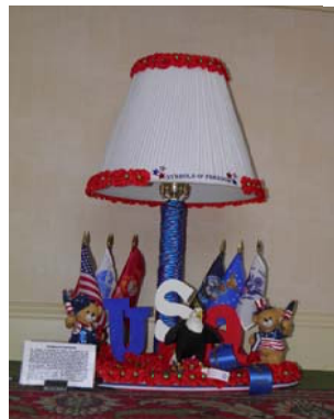
First Place Buddy Poppy Display Auxiliary 7589