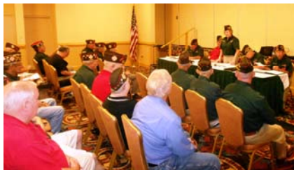
Council of Administration meeting