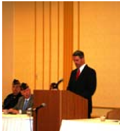
Attorney General Ken Cuccinelli addresses the opening session