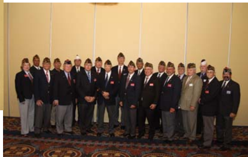
2013-14 VFW Department of Virginia Officers