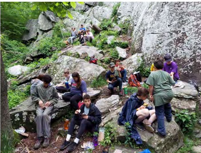
The Scouts on their Wilderness Survival camping trip.