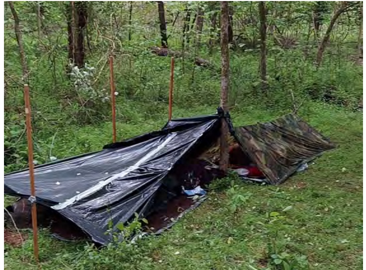
A typical Wilderness Survival shelter built by the Scouts.