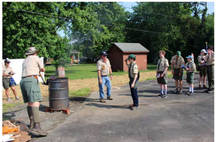
The Scouts respectfully retire unserviceable flags.