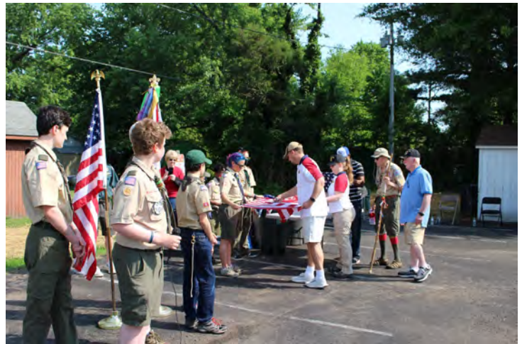
The Scouts prepare flags for retirement.