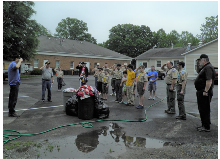
The Pledge of Allegiance preceded the destruction of unserviceable flags.