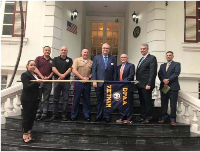
Meeting with members of Detachment 2, Defense POW/MIA Accounting Agency, at their headquarters in Hanoi, Vietnam.