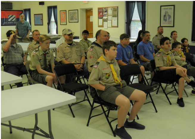
Flag education class was held prior to the retirement ceremony.