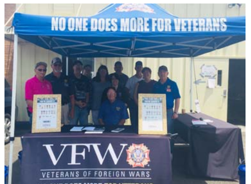
Carroll County Gazette