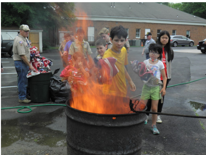
Approximately 1200 unserviceable flags were burned one at a time.