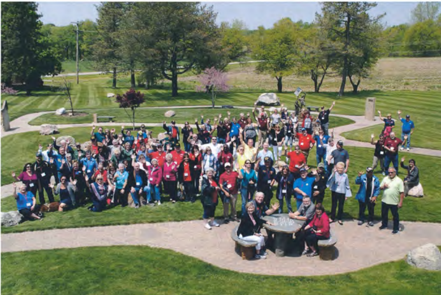
May 18 — JVCs and JVPs gather at the Tribute Park for a group photo