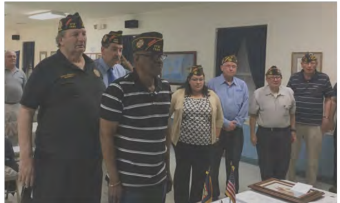
Installation of Post officers—April 7, 2018