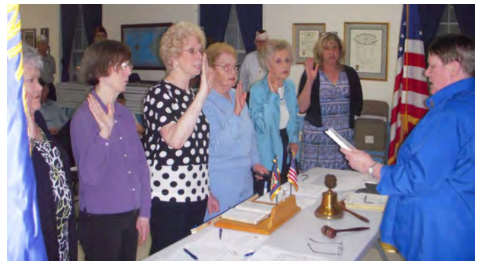
Installation of Auxiliary officers—April 7, 2018