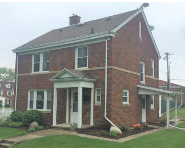
The Virginia House