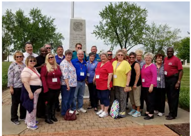
JVCs and JVPs from the Southern Conference at the WWII Memorial