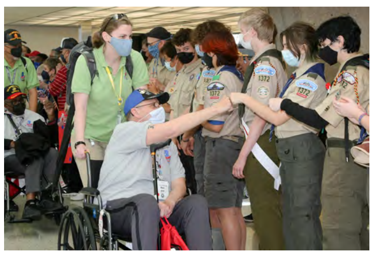
HONOR FLIGHT VOLUNTEER