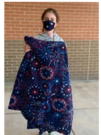
Blankets produced by the Purple Team on April 15, 2021