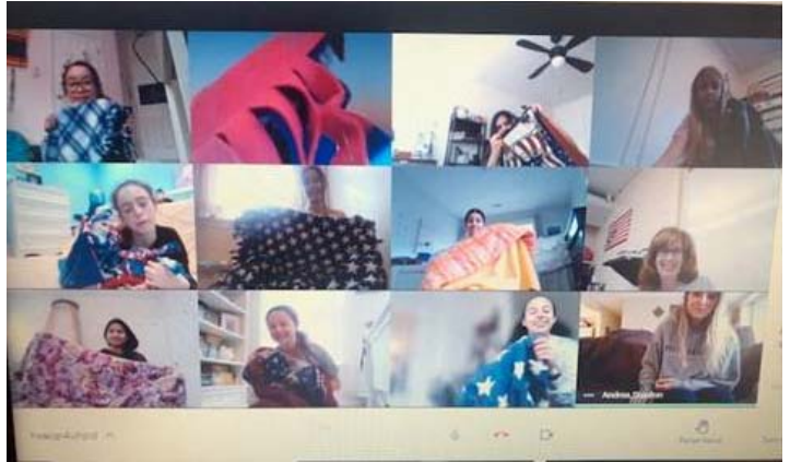
Meeting virtually to create blankets at home.

inviting only a few students to socially distance outside in order to teach them how to make blankets. Every Thursday after school, a small group met virtually, and they make the blankets at home. As you can see in the pictures below, it was not quite the same as last year, but we felt like it was a good solution given the circumstances.