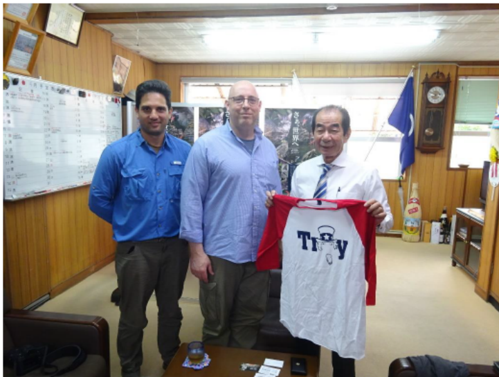
Courtesy visit to Mayor's office