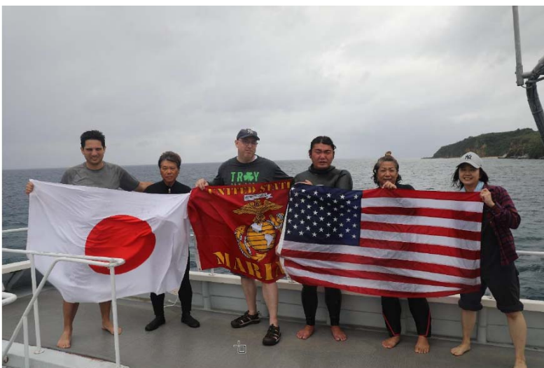
Team Effort to make it happen!