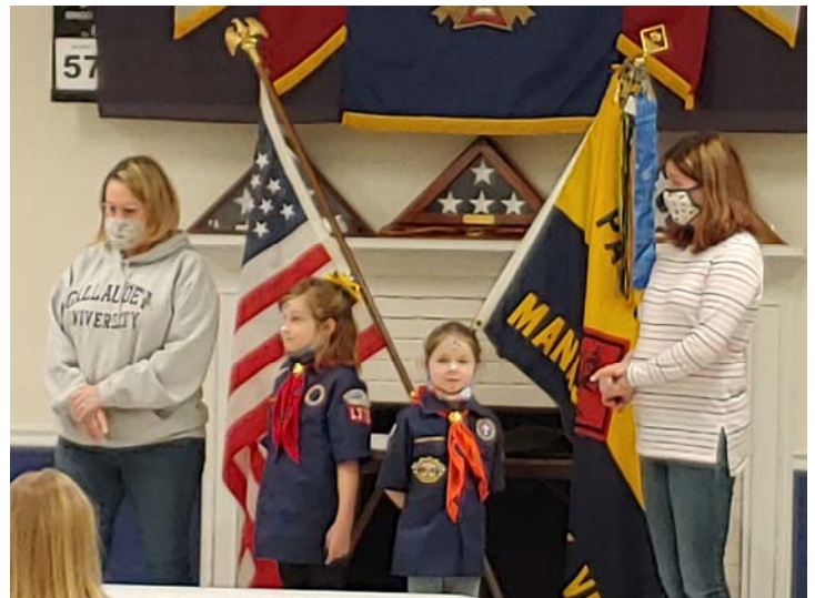
Two Cubs with their moms after being awarded their first rank.