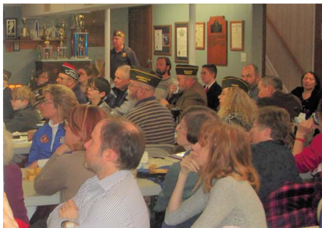
A full house at Post 9835