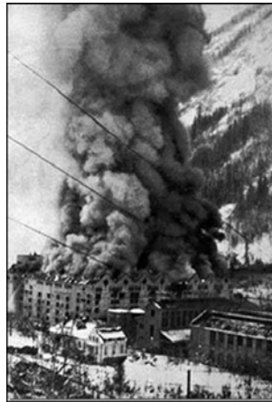
The R.A.F. destroys the Norwegian heavy water plant targeted by Moe Berg.

The parachute jump at age 41 undoubtedly was a challenge. But there was more to come in that same year. Berg penetrated German-held Norway, met with members of the underground, and located a secret heavy-water plant - part of the Nazis' effort to build an atomic bomb. His information guided the Royal Air Force in a bombing raid to destroy that plant.