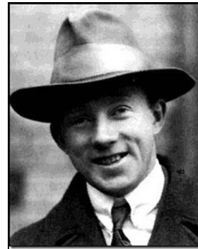
Werner Heisenberg - he blocked the Nazis from acquiring an atomic bomb.

If the German physicist indicated the Nazis were close to building a weapon, Berg was to shoot him - and then swallow the cyanide pill.