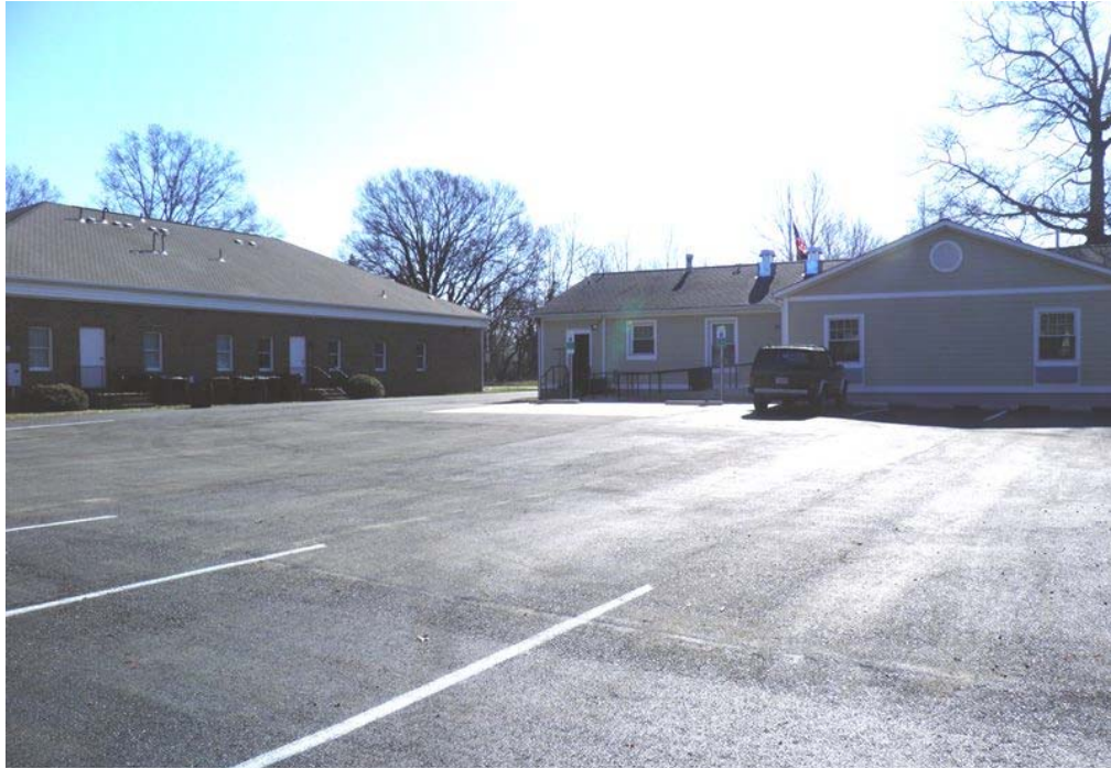
Our parking lot finally has been paved — See page 7.

Francis Cannon VFW Post 7589 Manassas, Virginia April 2015