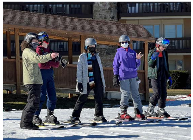
Scouts work on the Snow Sports merit badge