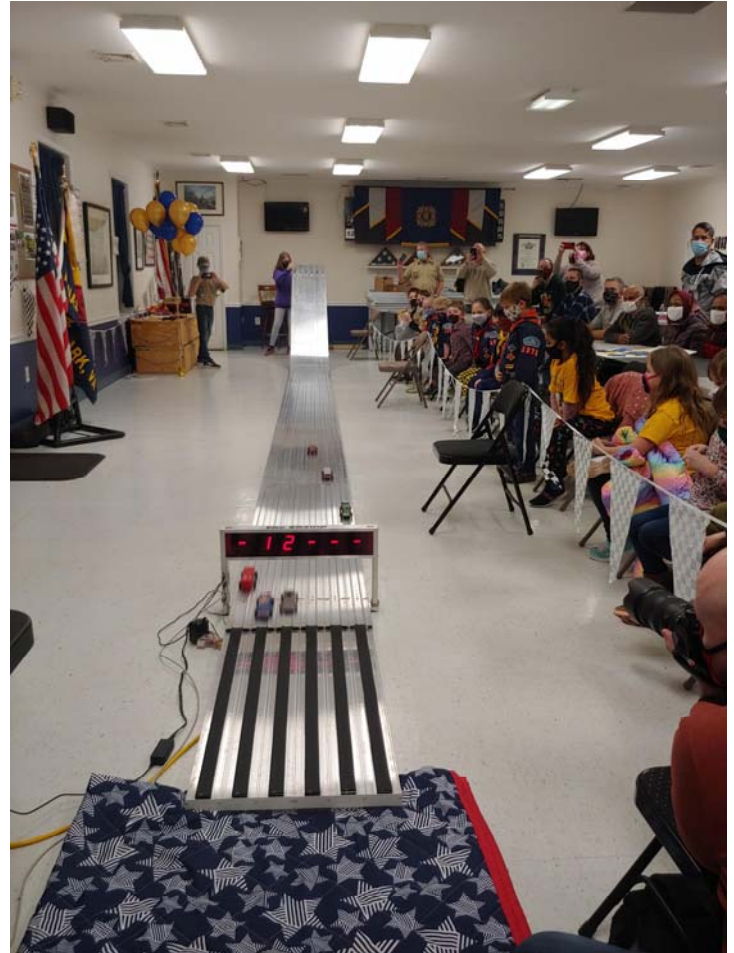
Scouts race their creations at the Pinewood Derby

Alex and Tina Bliem Post 7589 Troop/Crew/Pack 1372