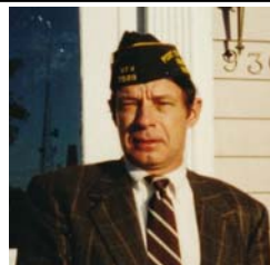
Photo from 1999-2000 Post 7589 Community Service Book