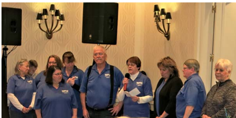
Department Auxiliary Line Officers