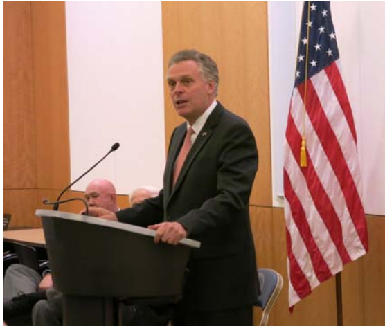
Two days before his inauguration Gov. Elect Terry McAuliffe addresses the Veterans Caucus.