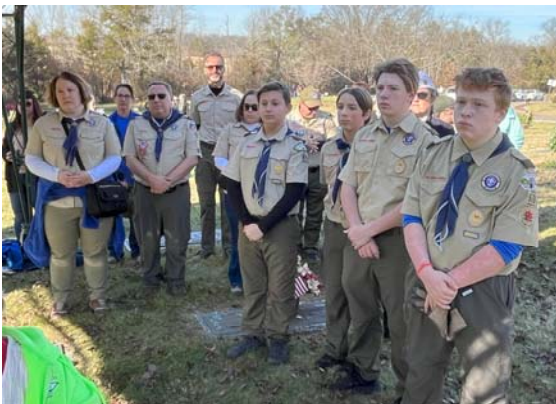
Clockwise from top left: