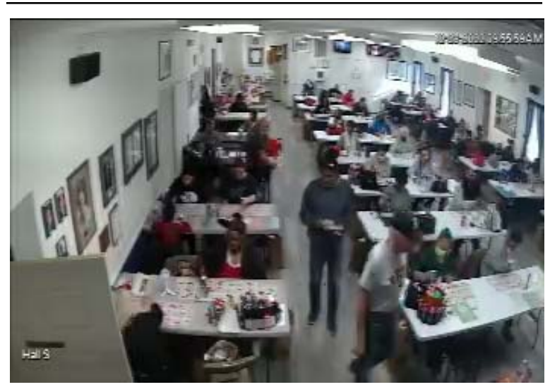
At our last bingo of 2022 we had quite a crowd. Join us any Wednesday morning. Doors open at 7:30 and games start at 9:15. Help is always welcomed.

To learn more about Medicare, please visit our Medicare Benefits page at <a href="www.ssa.gov/benefits/medicare">www.ssa.gov/benefits/medicare</a>. You may also read our publication at <a href="www.ssa.gov/pubs/EN-05-10043.pdf">www.ssa.gov/pubs/EN-05-10043.pdf</a>.