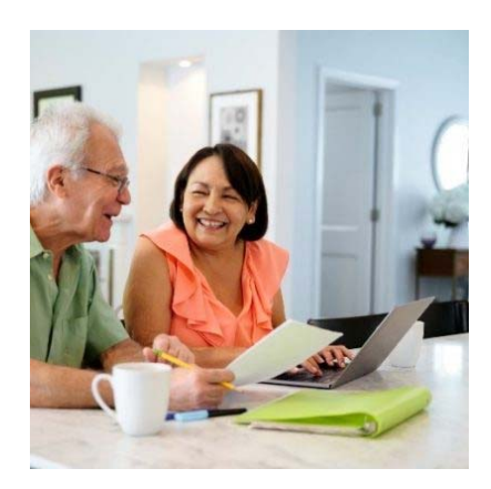
Social Security Public Affairs Specialist in Virginia

If you did not apply for Medicare Part B (medical insurance) within three months before or after turning age 65, you have another chance each year during the General Enrollment Period. The period runs from January 1 to March 31 every year.