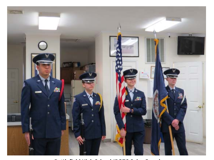
Battlefield High School JROTC Color Guard