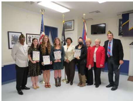
Voice of Democracy Winners