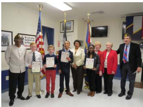
Patriot's Pen Winners