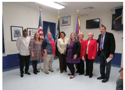
Teachers of the Year