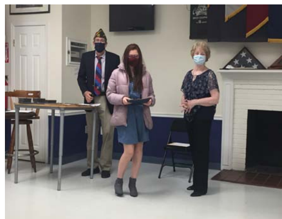
Three of our student award winners at our December 6 award ceremony