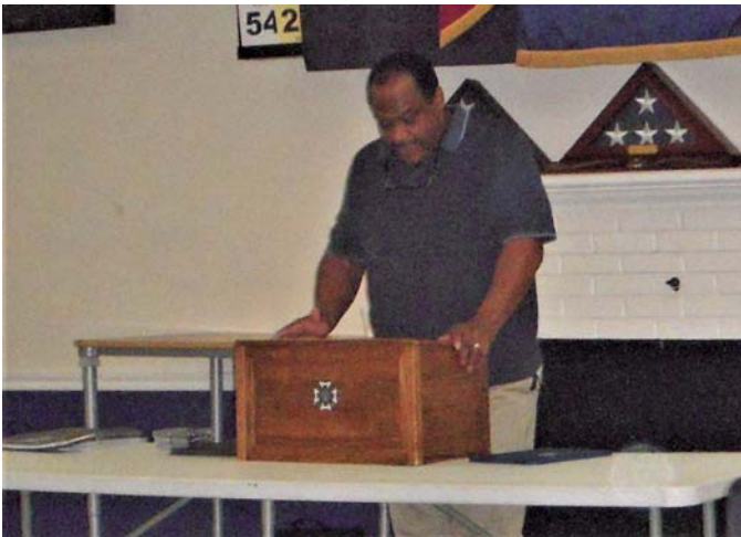
Post Judge Advocate, Retired Air Force Colonel Bobby Knight