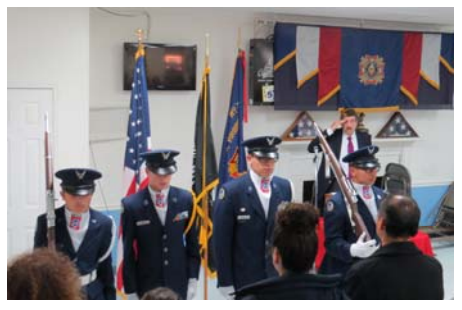
Stonewall Jackson HS JROTC provided the color guard.